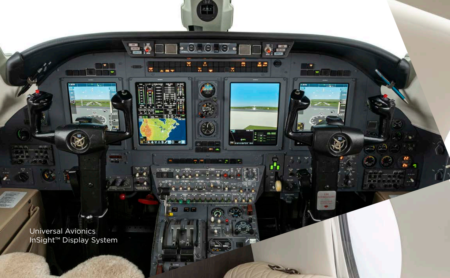
Universal Avionics InSight™ Display System