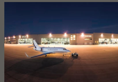
Battle Creek, Michigan